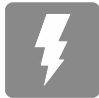
Power Backup For Common Areas And Lift