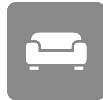
Sky Lounge at the Top Floor